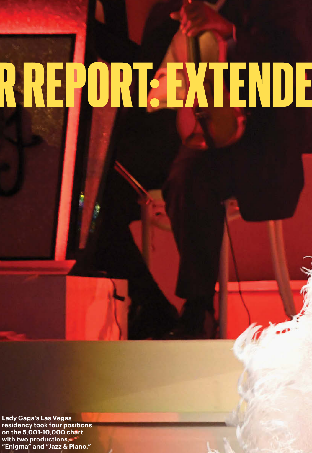
Lady Gaga's Las Vegas residency took four positions on the 5,001-10,000 chart with two productions, "Enigma" and "Jazz & Piano."

● The popularity of the Broadway sensation "Hamilton" is as evident on Hot Tickets as it is on any given night for fans entering the Richard Rodgers Theatre in New York City. The national tour of the Tony Award-winning musical hits the 2,001-5,000 chart nine times with grosses reported from eight-show